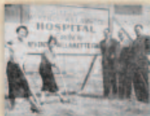
May 30, ground breaking for new hospital at the corner of 14th and G Streets. May 31, construction of the new hospital begins.