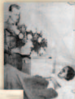
MWMC admits first patient the same day.