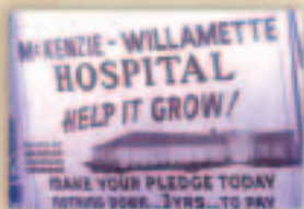
150-member Founders Service Organization begins fund-raising to build a hospital in Springfield.