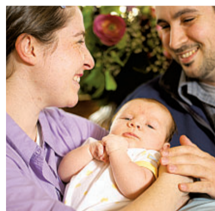
Our Women's Health and Birth Center offers a family-oriented birth facility.

Featured in the Birth Center are comfortable rooms, each with a Jacuzzi bathtub, CD/DVD player, TV, sofa and other amenities. Patients and families can rest easy knowing their room is a one-stop birthing unit, from initial check-in to post-delivery rest.