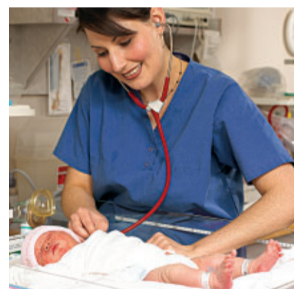
The Birth Center is equipped to take care of babies who need a little extra help.