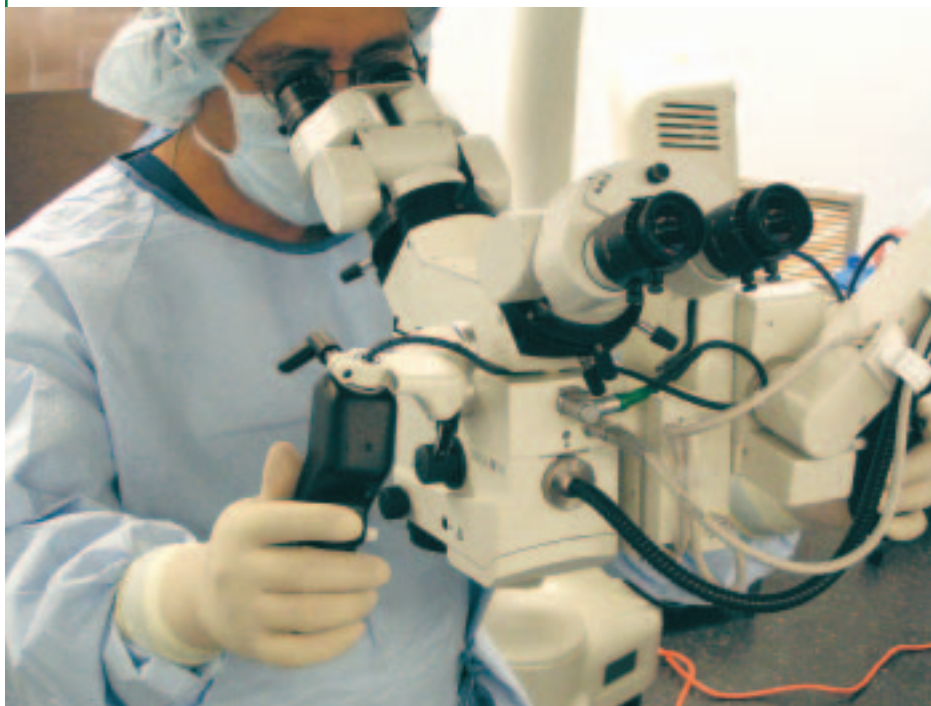
Pictured above, surgery technician demonstrates McKenzie-Willamette's new state-of-the-art Leica 520 Neurosurgical Microscope.

New and replacement equipment is arriving daily at McKenzie-Willamette Medical Center. The new equipment will enhance patient comfort and improve efficiency, and help position the hospital to continue providing extraordinary care now — and into the future.